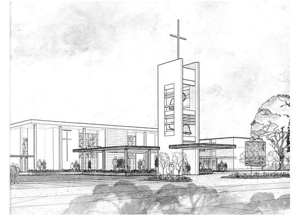
St. Edward the Confessor Catholic Church